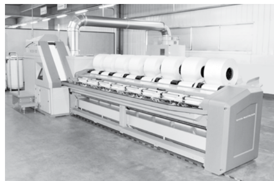
The 2-TWIN-DRIVE for driving the detaching rollers reduces the torsion by 75%

Truetzschler's contribution to the project is a new head stock with draw box and can changer. This includes the experiences gained in building draw frames with individual drives, equipped with highly dynamic levelling. DISC MONITOR, the latest draw frame quality sensor, has also been integrated. This permanent quality monitoring provides the data for automatic self-optimisation of the machine. Due to the individual drive technology of the combing elements, the piecing process, for instance, is automatically optimised. Furthermore, deviations in lap weight no longer present a problem, since sliver count is permanently monitored and corrected when necessary. This leap in technology was only made possible by simultaneously integrating the know-how of Truetzschler and Toyota. The new Toyota-Truetzschler Comber TCO 12